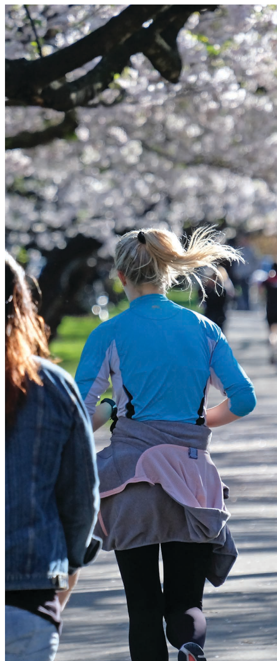
Runner, Hagley Park

The Greater Christchurch Regeneration Amendment Bill was introduced in Parliament on 19 February 2020 and was referred to the Governance and Administration Committee on 5 March 2020 after receiving its first reading. The Governance and Administration Committee invited public submissions, which it heard on 29 April 2020, and is due to report back to Parliament in June 2020. If agreed, the amendments are expected to be enacted by 30 June 2020 (subject to parliamentary processes).