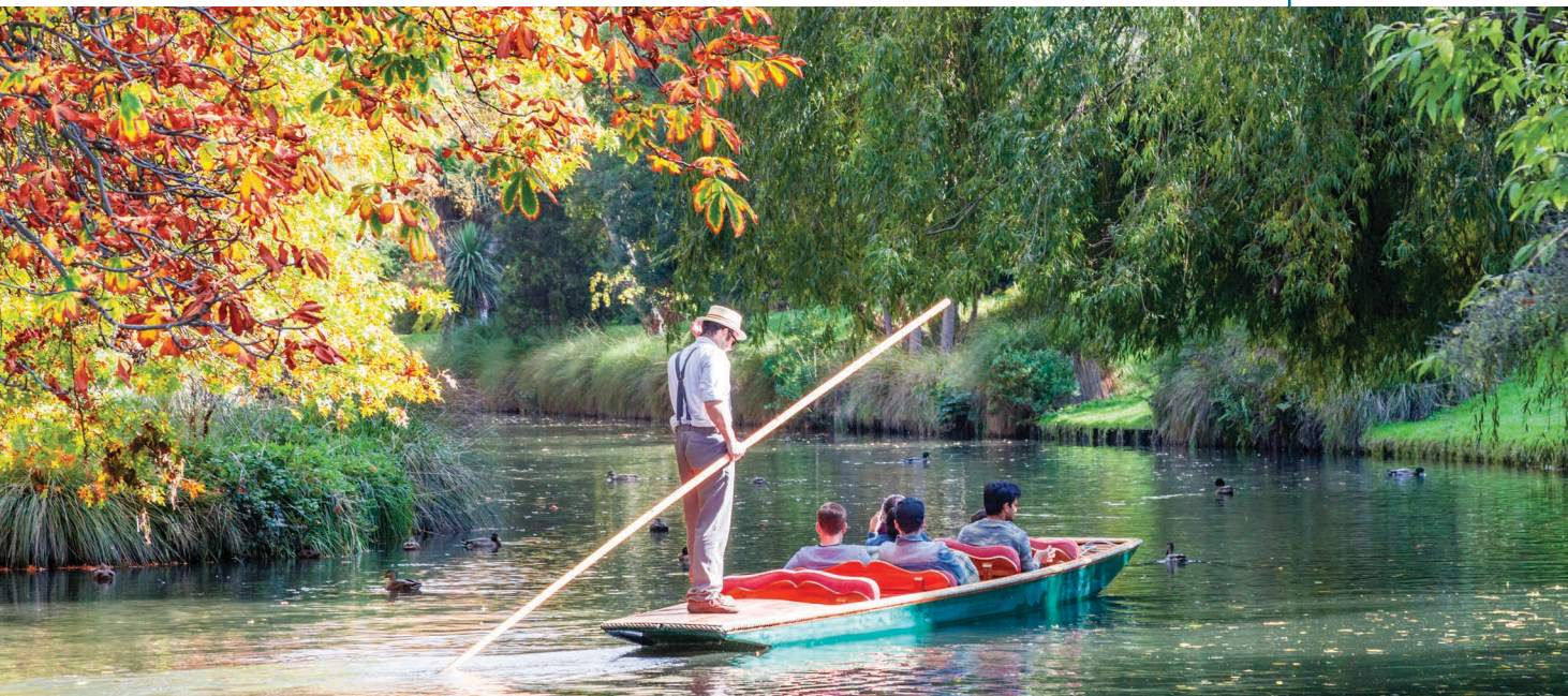
Punting on the Avon

To be effective, the regeneration agency requires regular and aligned guidance from its shareholders and opportunities to test emerging thinking about regeneration and its work programme. The work of the regeneration agency must also be fully supported in the public arena so that it is clear to the public, ratepayers and taxpayers that its work is welcomed and supported.