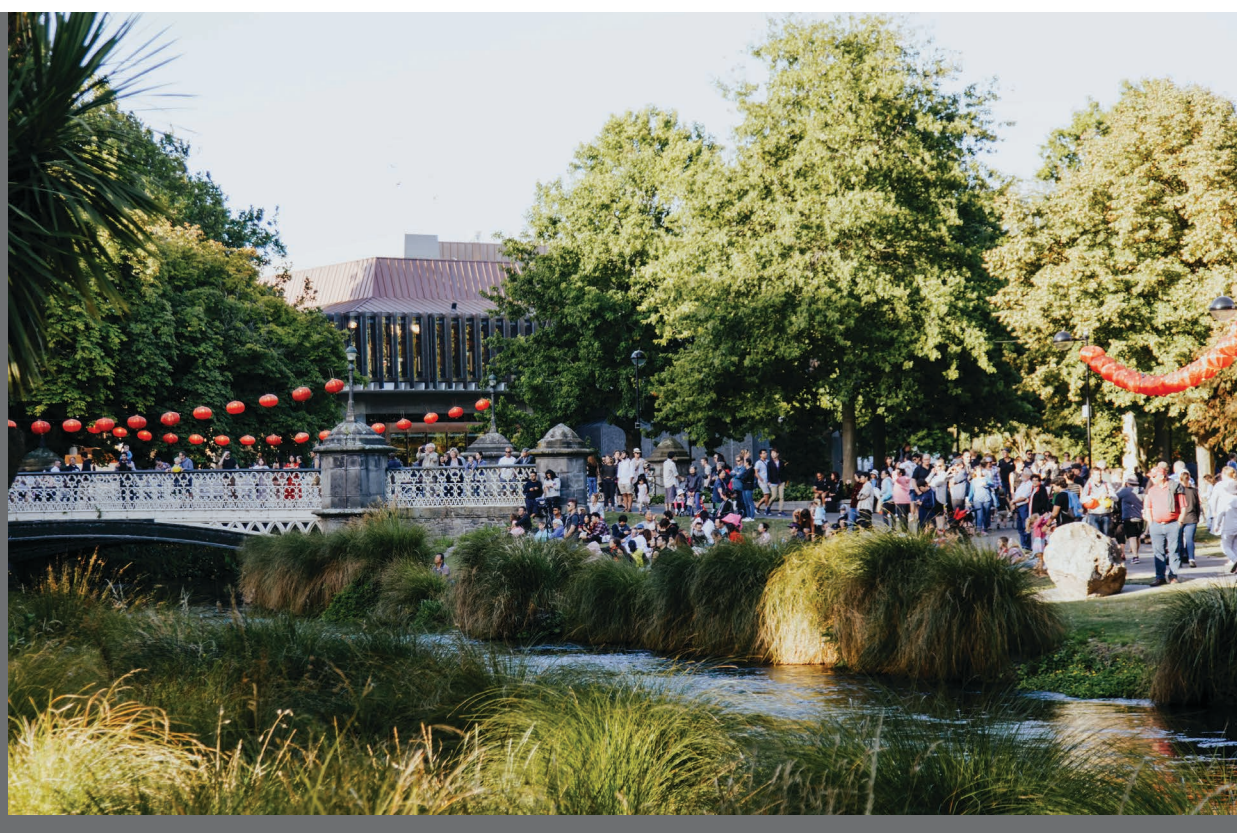
South Island Lantern Festival

The establishment of Regenerate Christchurch also represented a deliberate shift in leadership approach to a more collaborative way of working, built on strong working relationships and effective engagement with communities, iwi, the private sector and partner agencies.