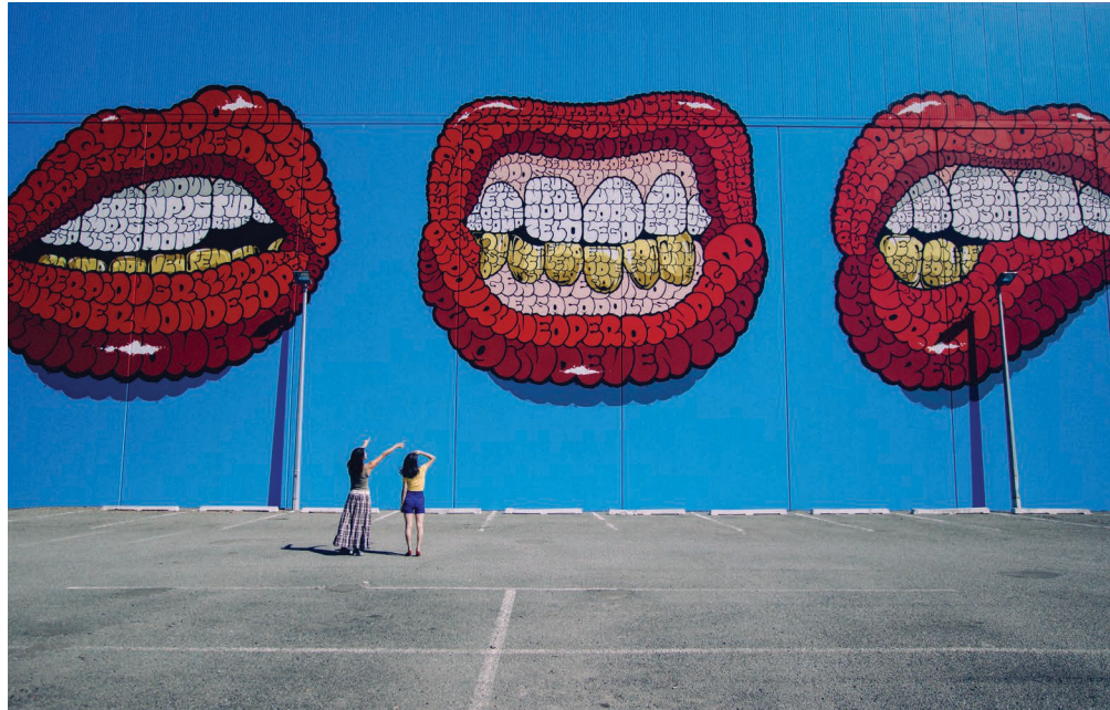
Inner City Street Art

Regeneration is ongoing – around the world, great cities are constantly renewing, developing and enhancing their urban environments. Christchurch should anticipate that progress and ongoing change will continue over the years ahead. It must also be ready to adapt to significant changes in the wider environment (for example, the significant economic and social impacts of COVID-19).