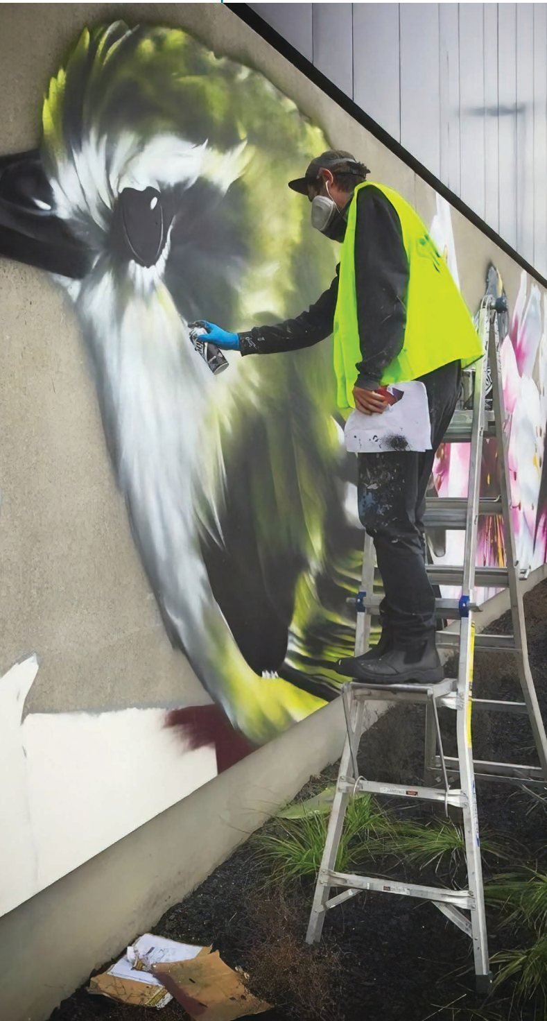
Street art work in progress